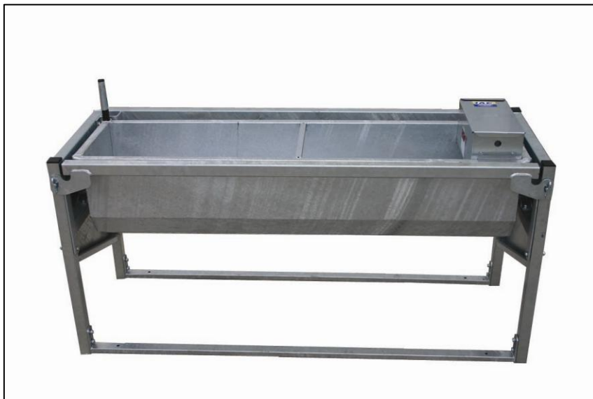
Tipping water trough system ( www.iae.co.uk )