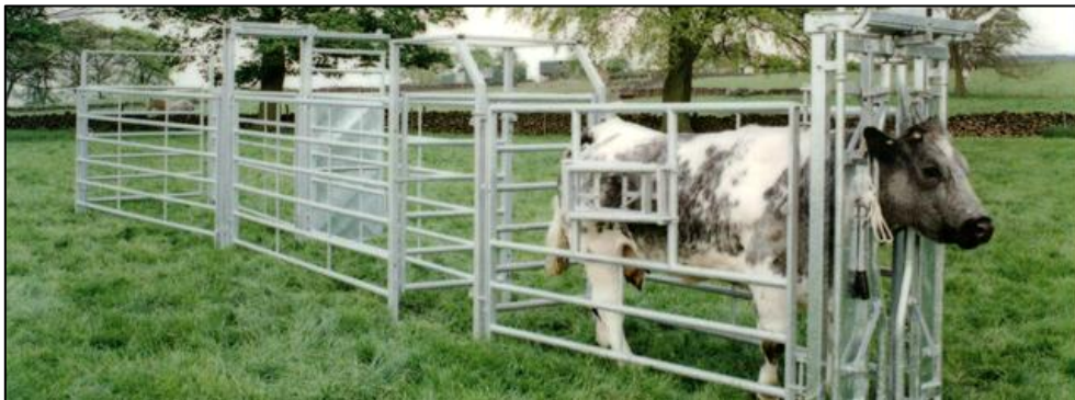
Mobile crush units for use in field situations ( www.iae.co.uk )