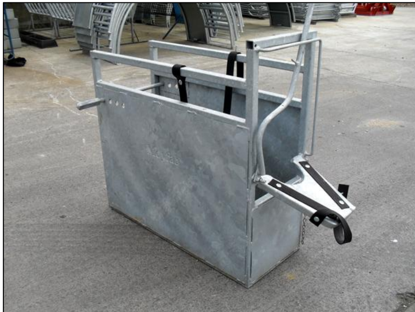
Smaller dedicated crates for calf dehorning ( www.iae.co.uk )