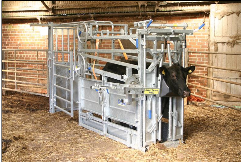
Crush equipment with optional head scoop for safer inspection and dosing of animals ( www.iae.co.uk )