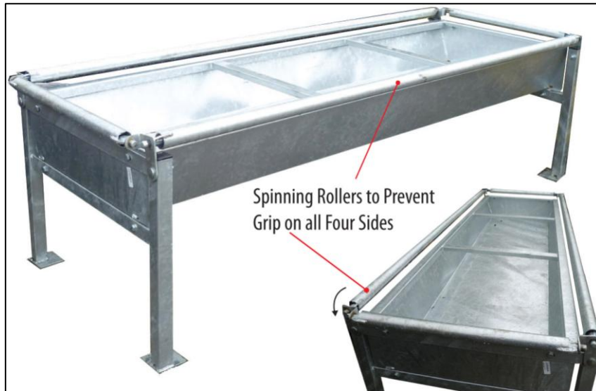
Badger-excluding feed trough