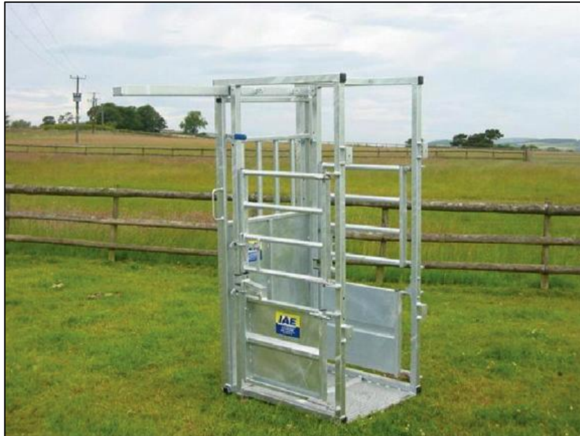
Crush extensions for increased safety at rear animal ( www.iae.co.uk )