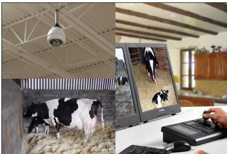
Wired or wireless cameras for installation in calving sheds ( http://www.dswcctv.co.uk )